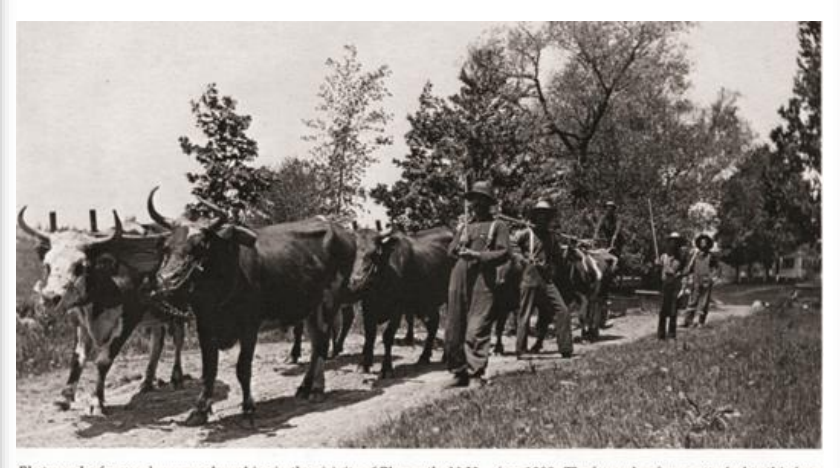
Photograph of an ox-drawn road machine in the vicinity of Plymouth, N.H., circa 1900. The four yoke of oxen attached to this fourwheel grader are indicative of the motive power needed for larger road machines. Such machines had a seat used by a driver when pulled by horses, but required men with goads when pulled by cattle; a man on the machine guided the blade in either case.