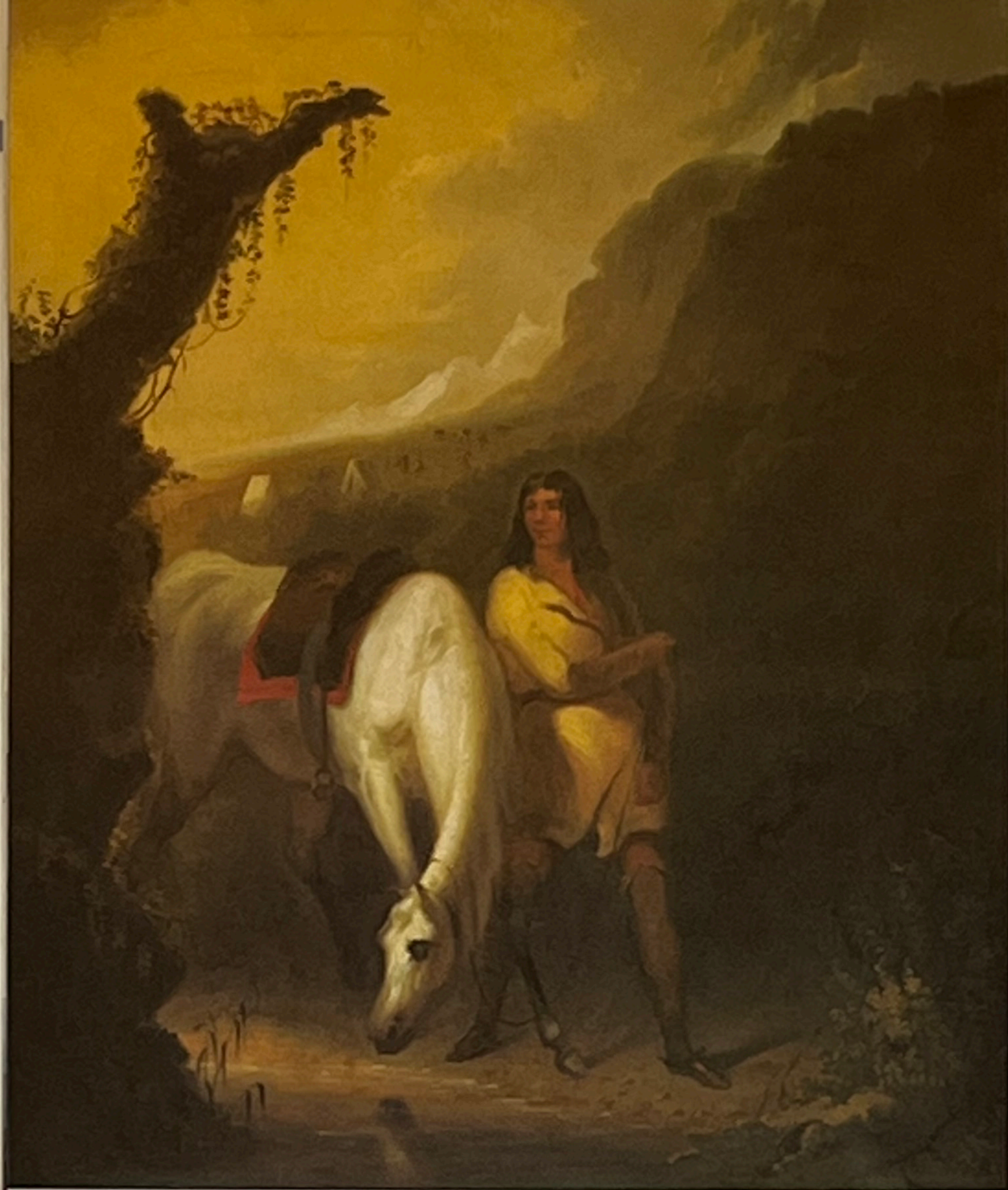
Antoine Watering Stewart's Horse

Oil on Canvas | 30 x 36 inches | 1840 | American Heritage Center, Laramie, Wyoming. ah04912_005