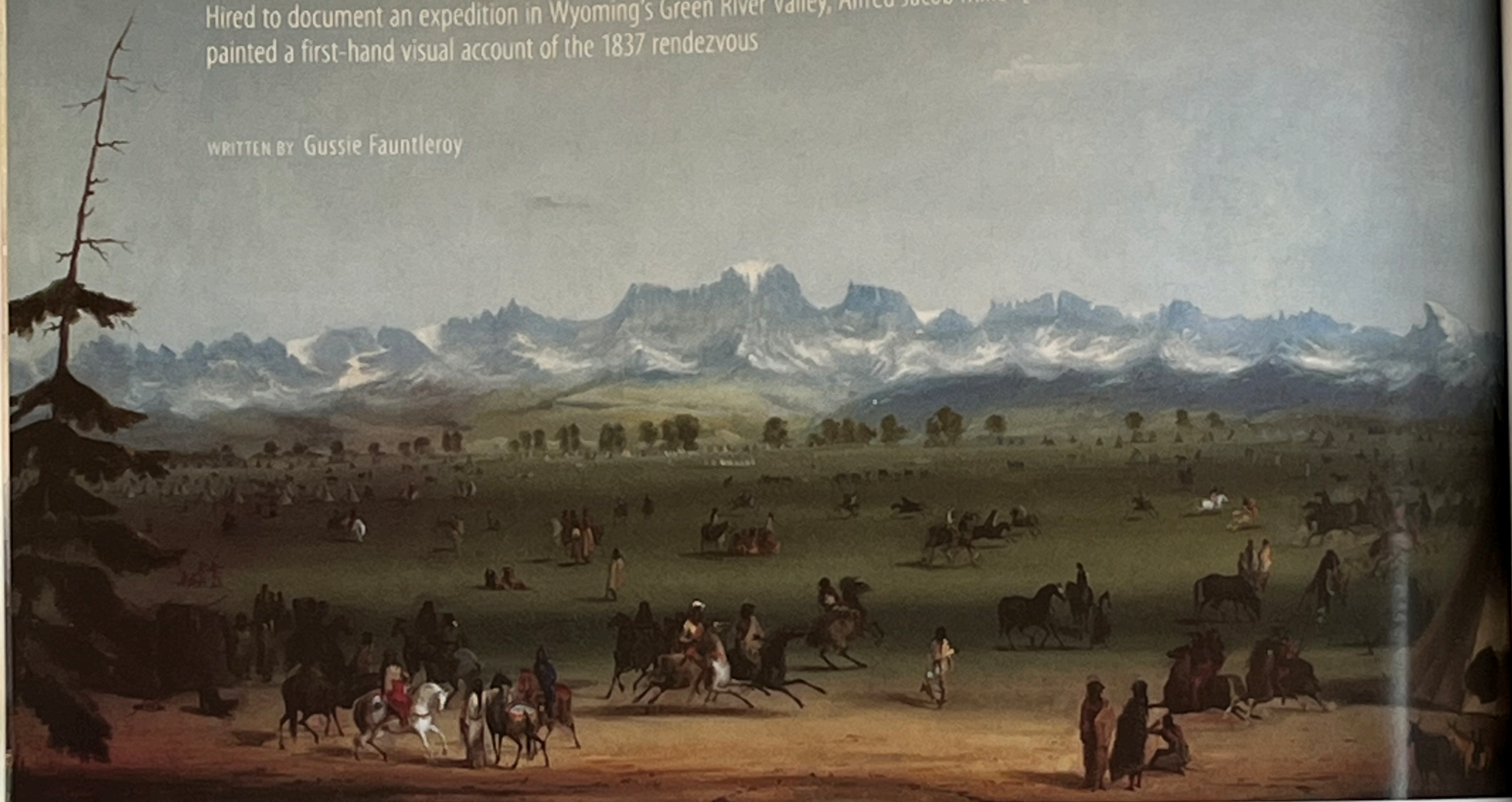
Rendezvous Near Green River (General View of the Indian Camp under the Mountains of the Winds) Oil on Canvas | 32 x 38 inches | 1838–1839 | American Heritage Center, Laramie, Wyoming. ah04912_003

Working on a commissioned portrait in his newly opened New Orleans studio in early 1837, Alfred Jacob Miller looked up to see a handsome, well-dressed man enter the shop and watch quietly for a few moments as he painted. Miller may not have thought much of it at the time, but the stranger's second visit a few days later would bring an offer of unimaginable adventure, challenge, and opportunity that would reverberate through the rest of the artist's life, career, and well beyond.