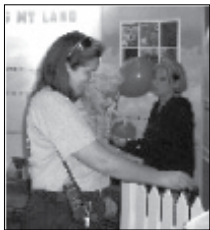
Between Fences opens in Pinedale

• Museum on Main Street's Between Fences exhibit traveled throughout Wyoming in 2007. The exhibit was on display at the Sublette County Library, Pinedale; the Uinta County Museum, Evanston; the Sheridan County Fulmer Public Library, Sheridan; the Meeteetse Museum District, Meeteetse; and the Crook County Museum, Sundance.