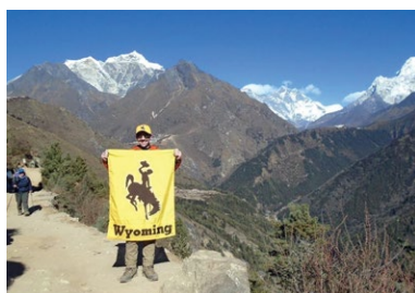
Photo was taken about a mile up from Namche Bazaar on the approach to Mount Everest.

Stacy (Madden) Buchholz, B.A. '07 , women's studies, M.P.A. '13 , public administration, received the UW Extension's Diversity