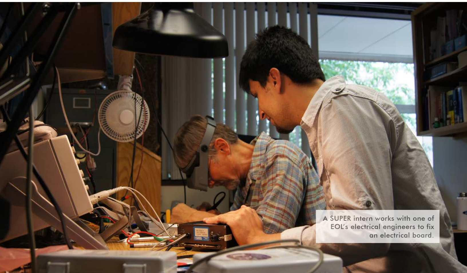
A SUPER intern works with one of EOL's electrical engineers to fix an electrical board.

The Earth Observing Laboratory (EOL) is committed to building a professional STEM workforce for future generations, and offers a unique experience with foundations in observational science and engineering to undergraduate students. EOL hires undergraduate engineering students who would like to gain skills and knowledge in the atmospheric sciences during the summer months for the Summer Undergraduate Program in Engineering Research (SUPER). SUPER interns work hand-in-hand with NCAR/EOL engineers and technicians on atmospheric observing systems and developments, including radar, lidar, and sounding systems and associated software developments. Interns may spend part of the summer participating in a field deployment, operating and supporting one or more EOL observing systems.