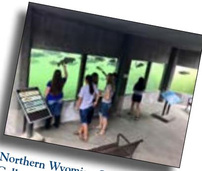
Northern Wyoming Community College District GEAR UP students toured the Spearfish fish hatchery.

They also visited Black Hills State University (BHSU) in Spearfish, South Dakota. During a financial aid presentation, students learned that BHSU offers in-state tuition to Wyoming residents. They also learned about the Bryan and Dorothy Dodd no interest student loan program for students in Campbell, Johnson, and Sheridan Counties.