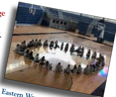
Eastern Wyoming College GEAR UP students discussing college requirements.

Eastern Wyoming College took their GEAR UP students to visit Gillette College where they learned about admission requirements, scholarships, financial aid, and student life. On the trip back, they discussed preparing for college and researching various degrees.