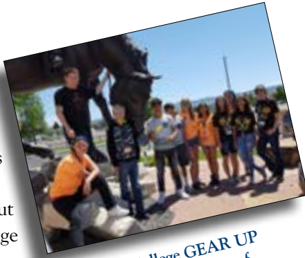
Northwest College GEAR UP students at the University of Wyoming during Camp GEAR UP.

Northwest College GEAR UP students toured Montana State University campuses in Bozeman and Billings to learn about college life and college preparation. They played a financial aid trivia game to discover ways to help pay for college. They also visited the Yellowstone Art Museum and the Museum of the Rockies to explore careers.