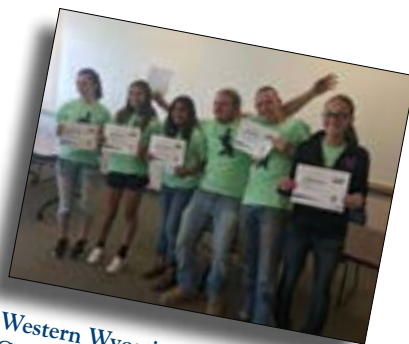
Western Wyoming Community College GEAR UP students with certificates for completing FOCUS training during a summer academy.

In addition to the college visits, they visited and learned about careers at historic sites and local museums.