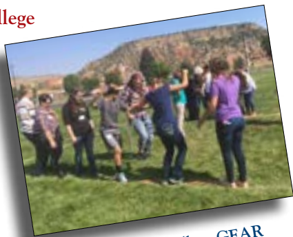
Central Wyoming College GEAR UP mentors worked with incoming freshmen GEAR UP students during high school day orientation.

They also attended two academic classes taught by college instructors to experience what a college class is like.