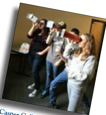
Casper College GEAR UP students built telescopes for the solar eclipse.

GEAR UP students also visited Casper College to learn about the benefits of attending college, admission requirements, scholarship opportunities, and financial aid.