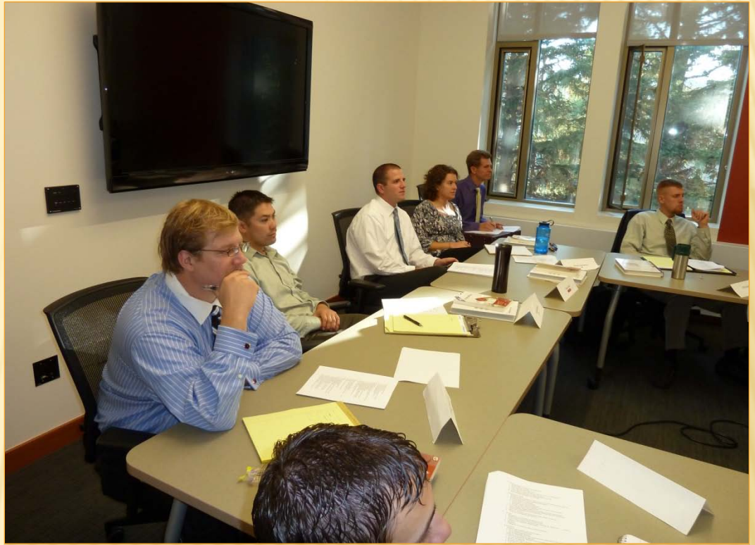
JD/MBA STUDENTS DISCUSSING TRANSACTIONS