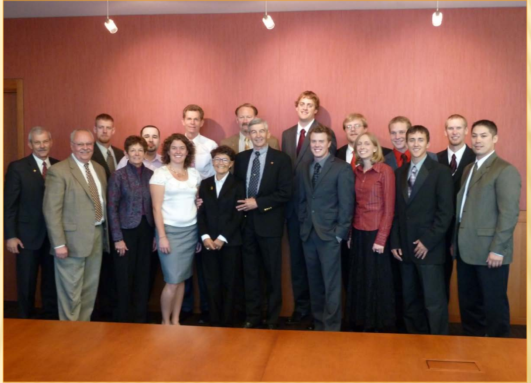
THE MBA TEAM AND THE JONAH BANK TEAM