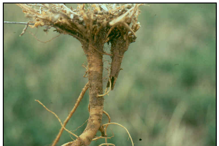
Figure 2. Three-year-old plants affected by brown root rot. The plant on the right is dead with the tap root completely rotted, while the plant on the left has a dark brown girdling lesion on the root and was slow to produce spring growth. Plants were collected near Farson.

Feeder roots and nitrogen fixing nodules are often the first tissues to show discoloration and rot. Symptoms vary from small circular dark lesions to larger areas with rot which may completely sever the root from the plant (Figure 2). Crowns and shoots of affected plants may either be partially or entirely killed. Fruiting structures of the fungus, Phoma sclerotioides , may be present as tiny black dots on the surface of diseased roots. Some plants with BRR may remain productive over the short-term while others exhibit varying degrees of above-ground stunting and decline. Winterkill, a symptom of BRR that is generally noticed in the early spring, may vary from slight (< 5% dead plants) to severe (> 95% dead plants).