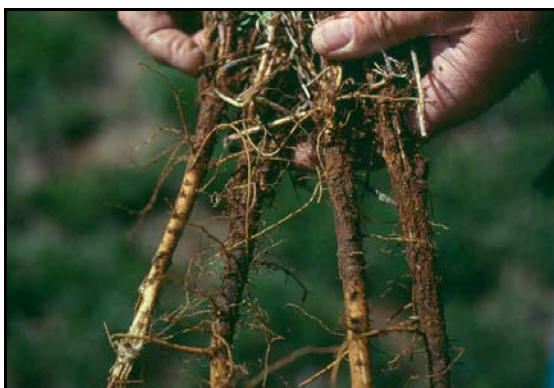
Figure 1. Three-year-old alfalfa plant collected near Farson showing severe rot of the tap and secondary roots caused by brown root rot. Note the dark brown to black discoloration of the lower plant crown and upper root.

Symptoms. Although BRR may be detected on 2-year-old plants, distinguishable root symptoms are usually not present until the third year after seeding. Root symptoms consist of tap and secondary root rot (Figure 1).