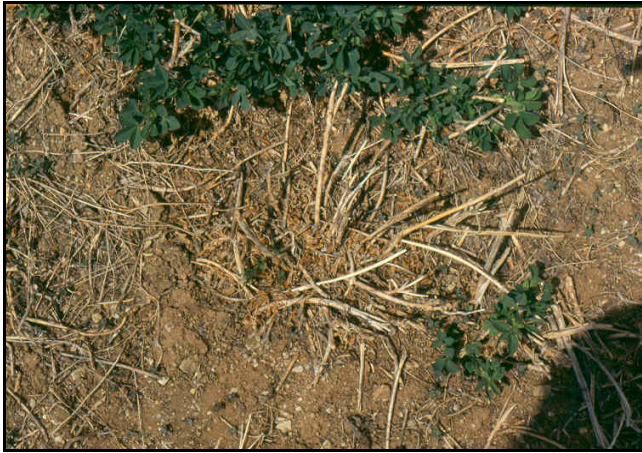
Figure 3. Winterkill of alfalfa near Farson in 1996 due to severe brown root rot injury.

Diseased plants often green-up slowly in the spring (Figure 3). BRR appears to occur throughout fields rather than in localized areas. In an established alfalfa field near Eden, Wyoming an estimated 88% of plants sampled throughout the field had BRR symptoms.