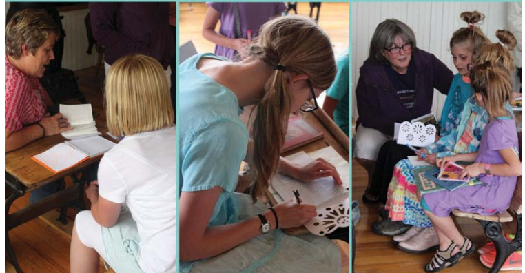
Collage of photographs taken during “Centennial Writes: A Collection of Our Stories.”

Centennial Writes: A Collection of Our Stories