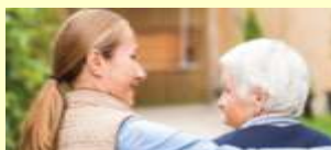
Older Adults and Caregivers