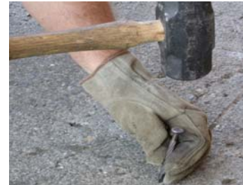
(Properly driving in a nail)