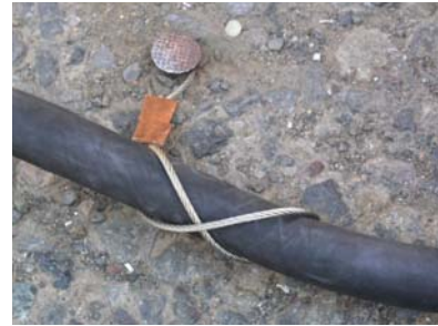
(Properly set up figure 8 fastener)