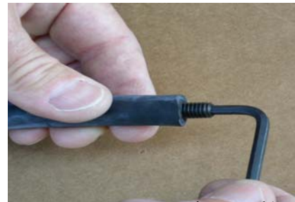
(Road tube plug being inserted.)