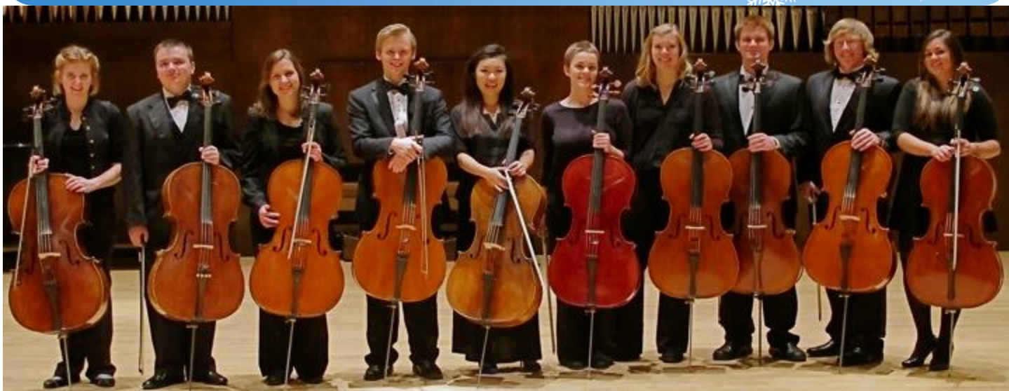
Members of the UW Cello Studio