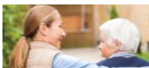
Older Adults and Caregivers